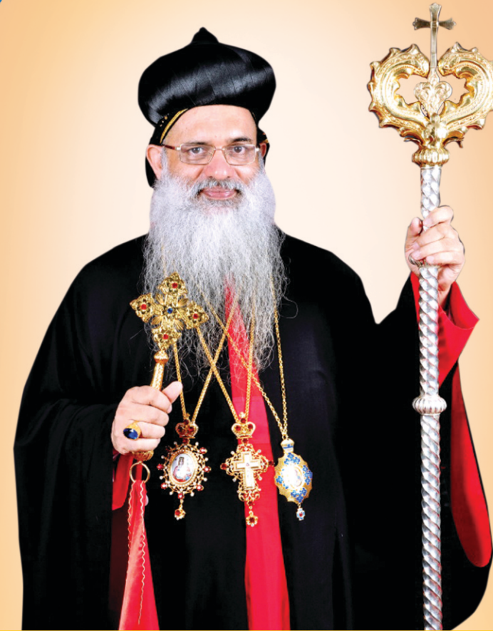
H.H. BASELIOS MARTHOMA PAULOSE II Catholicos of the East and Malankara Metropolitan